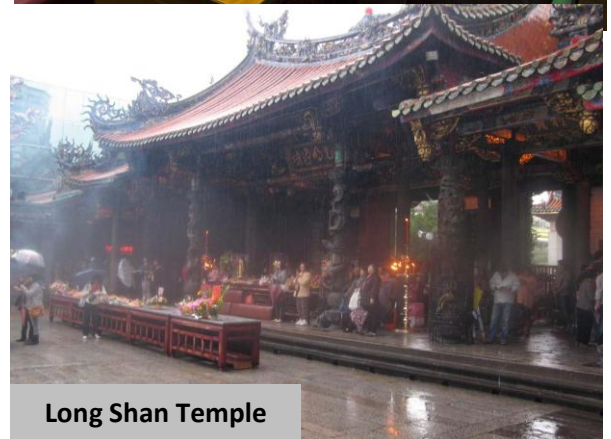
Long Shan Temple