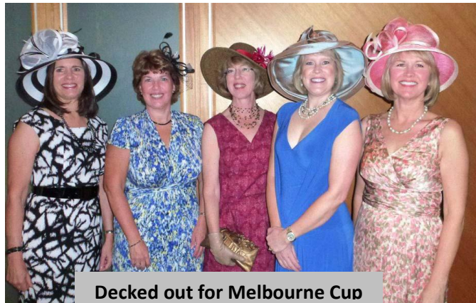
Decked out for Melbourne Cup