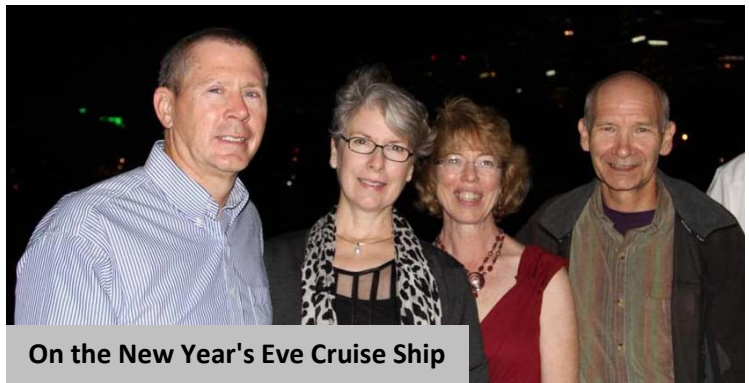
On the New Year's Eve Cruise Ship

On New Year's Eve we made our way from Katoomba into Sydney by car and train, and boarded a Captain Cook cruise ship near the Opera House and Sydney Harbour Bridge. After a very nice dinner on board, we watched the fantastic 9 PM and Midnight Sydney fireworks from the middle of the harbor.