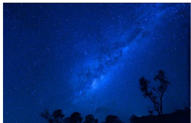
The Milky Way from Southern Hemisphere