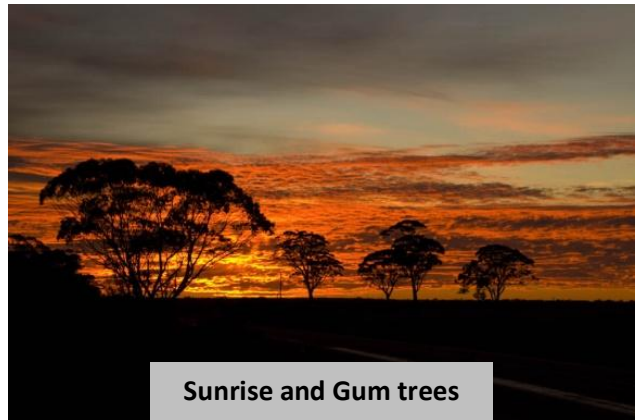
Sunrise and Gum trees

One day at Karajini, we swam in Fern Pool, a formerly secret Aboriginal location, and experienced a refreshing shower in the warm water falling over the 2.4 billion-year-old banded-iron rock