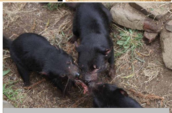
Three Tasmanian Devils fighting for food