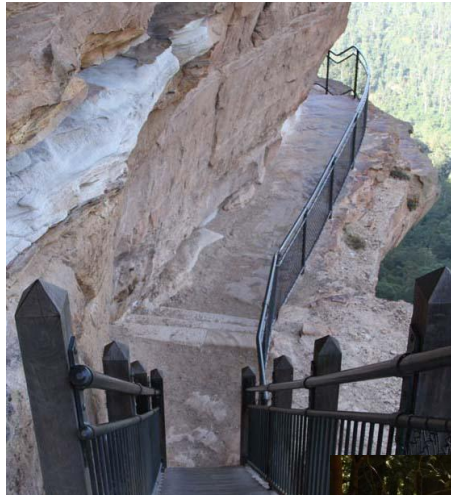
A Trail on the Edge

Internet connectivity allows modern hikers to conduct last minute business from the trail.