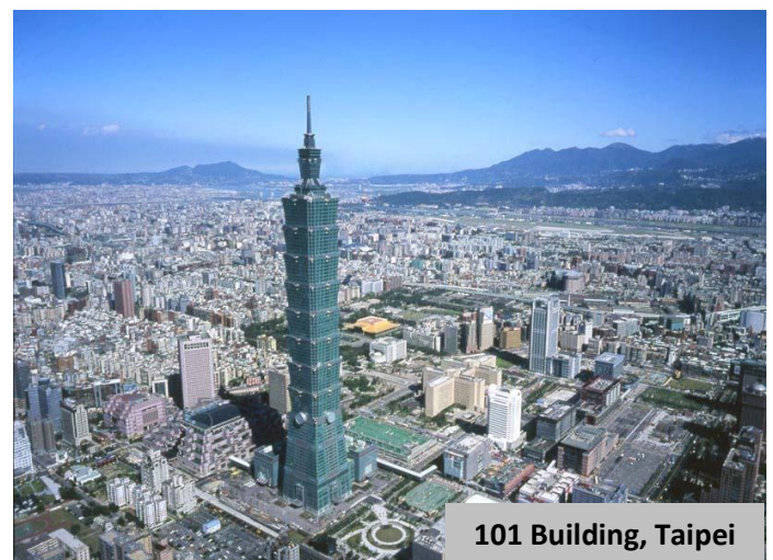
101 Building, Taipei