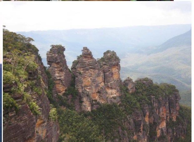
The Three Sisters