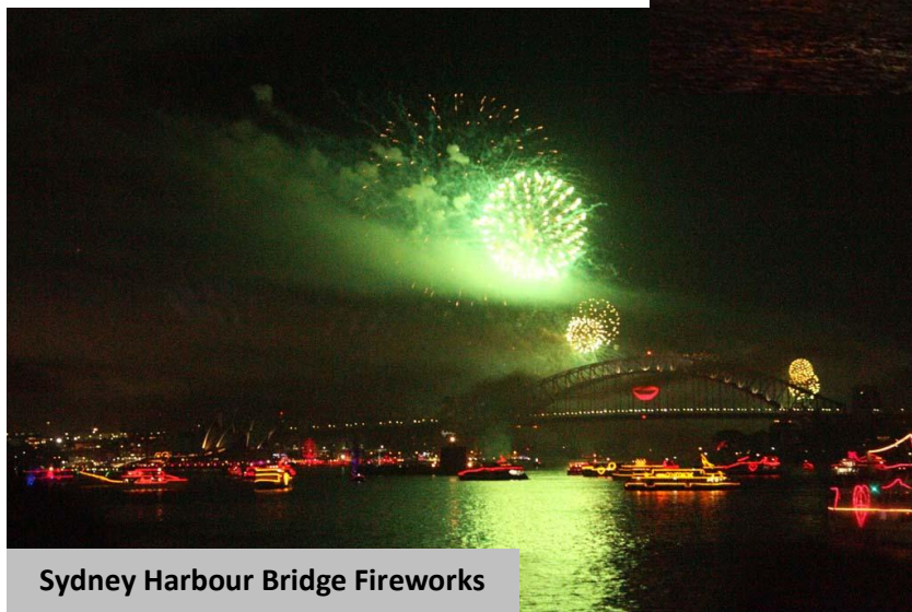
Sydney Harbour Bridge Fireworks