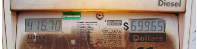
Fuel bill for the road train truck before us!