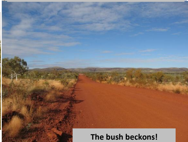
The bush beckons!