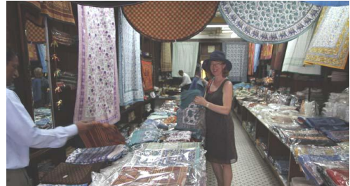
Shopping for fabric, Singapore