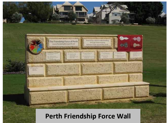
Perth Friendship Force Wall

This year we hosted small dinner parties with the Perth, Australia Friendship Force members for ambassadors from Oita, Japan and from Taipei, Taiwan.