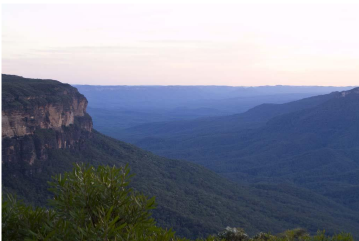
The Blue Mountains