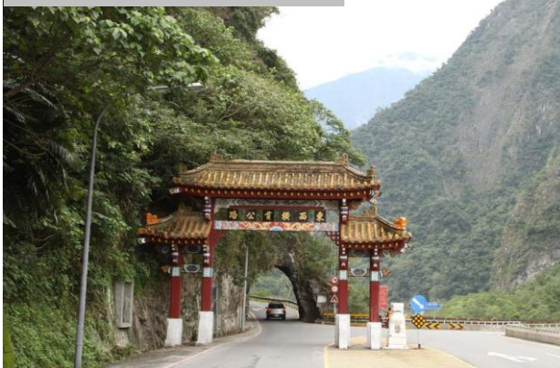
Entrance to Taroko Gorge

On another day we took a plane, bus and train ride to see Taroko Gorge, south of Taipei. This is a steep-walled marble canyon. The narrow road is quite an engineering feat. It runs from cliff edges to tunnels and across artistic bridges. The road was built by Chiang Kai Shek's army after World War II. The road begins with a formal entry way. Remote Buddhist Temples perch on steep hillsides.