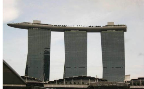
Marina Bay Sands Hotel, Singapore