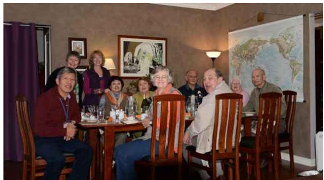
Dinner with Ambassadors from Oita, Japan